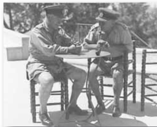
Generals Blamey and Allen conferring in Beirut in 1941