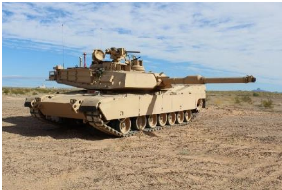
The ADF is purchasing up to 75 M1A2 Abrams System Enhancement Package version 3 tanks

Enhancements to the Australian Defence Force’s combat capability will be delivered by the Government through the purchase of evolved Abrams tanks and combat engineering vehicles. Minister for Defence Peter Dutton announced a $3.5 billion investment in the main battle tank upgrade (LAND 907 Phase 2) and combat engineering vehicle (LAND 8160 Phase 1) projects. Army will receive up to 75 M1A2 SEPv3 Abrams tanks, 29 M1150 assault breacher vehicles, 17 M1074 joint assault bridge vehicles and an additional six M88A2 armoured recovery vehicles.