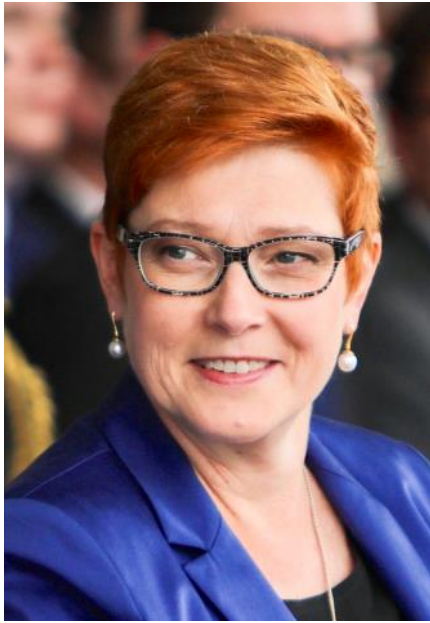
Senator the Hon Marise Payne Minister for Foreign Affairs

On 21 January 2022, Minister for Foreign Affairs and Minister for Women Senator the Hon Marise Payne and Minister for Defence the Hon Peter Dutton MP hosted the Secretary of State for Foreign, Commonwealth and Development Affairs the Rt Hon Elizabeth Truss MP and Secretary of State for Defence the Rt Hon Ben Wallace MP for the Australia-UK Ministerial Consultations (AUKMIN).