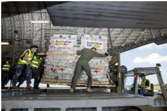
RAAF personnel unload humanitarian and engineering equipment from a C-17A Globemaster aircraft at Fua'amotu international airport in Tonga

The Australian Defence Force is supporting Tonga following the eruption of the Hunga Tonga-Hunga Ha'apai underwater volcano on January 15. Defence, as part of the whole-of-Australian Government effort coordinated by the Department of Foreign Affairs and Trade, has established Operation Tonga Assist 2022.