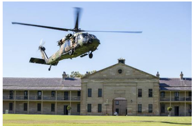
An Australian Army S-70A-9 Black Hawk helicopter lands at Victoria Barracks in Sydney