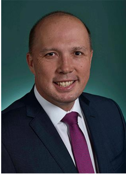
The Hon Peter Dutton – MP Minister for Defence

HMAS Adelaide arrived in Tonga on 26 th January 2022 with additional humanitarian and medical supplies, engineering equipment and helicopters to support logistics and distribution as Australia continues its support in partnership with the Tongan Government following the volcano and tsunami. Australia is widening its support, including through the restoration of power and communications, the storage and effective delivery of relief supplies, and further recovery efforts on the outer islands most affected.