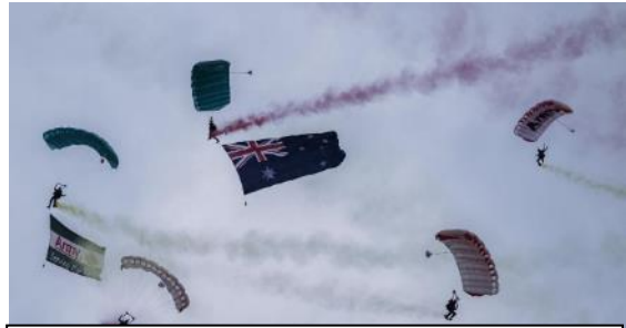
Australian Army soldiers from the ADF Parachuting Red Berets parachute display team drop into Sydney's Australia Day festivities.

The Australian Defence Force's Red Berets parachute display team thrilled spectators celebrating Australia Day as they soared over the Sydney Opera House on January 26. Trailing smoke and carrying a huge Australian national flag and an Army flag, four paratroopers leapt from the ramp of a CASA 212 aircraft, formed-up into a tight formation and landed safely together in Circular Quay as the sun set over Sydney Harbour.